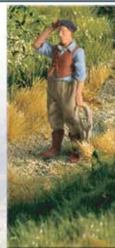
"You're telling me I need to plan ahead?... Not me..."

Usually in nature grasses never grow in a perfect 'golf course' type field. Plan to have open patches of dry dirt, tall weeds, dead fall and rock outcroppings. Mix things up. Remember, the more scenic textures you are able to put into your model, the more real it will appear.